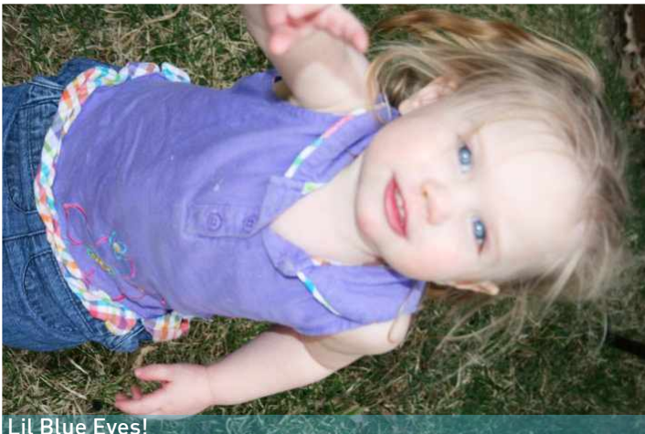
Lil Blue Eyes!