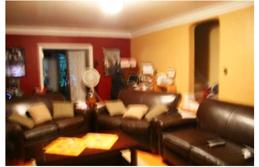
picture 2 of the living room