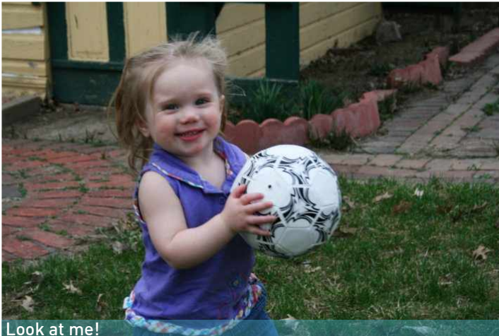
Look at me!